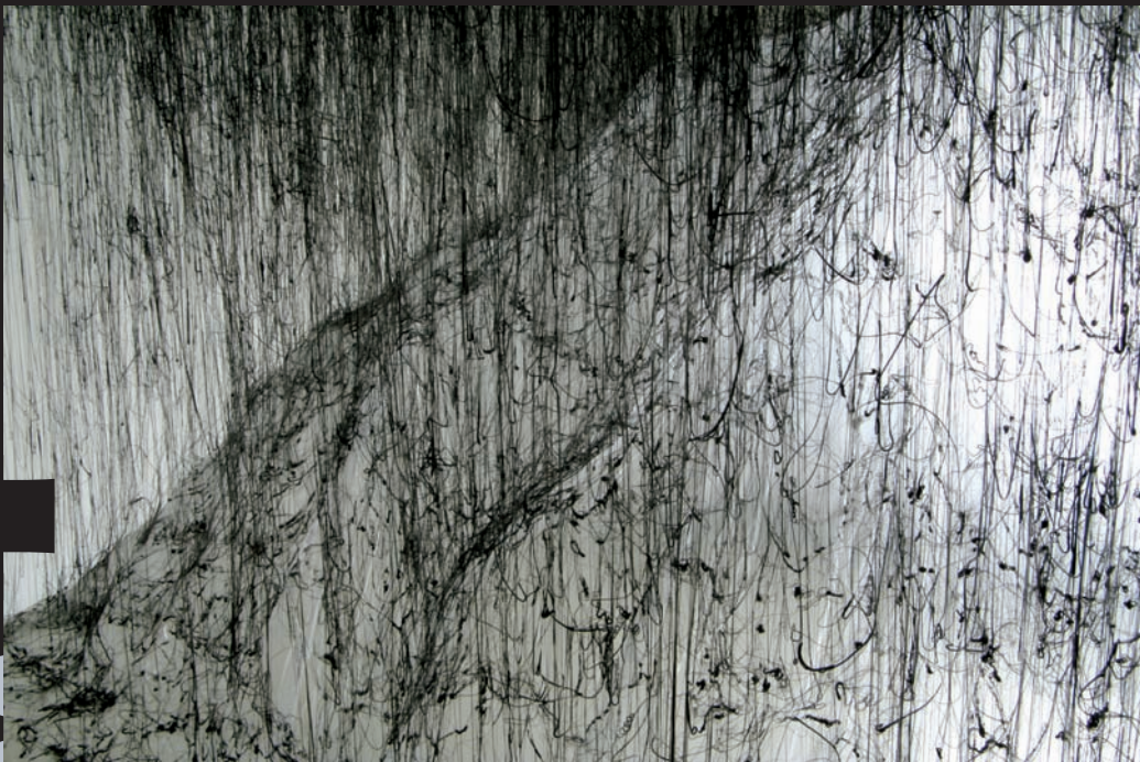
Yasuaki Onishi, untitled , 2009, black glue installation